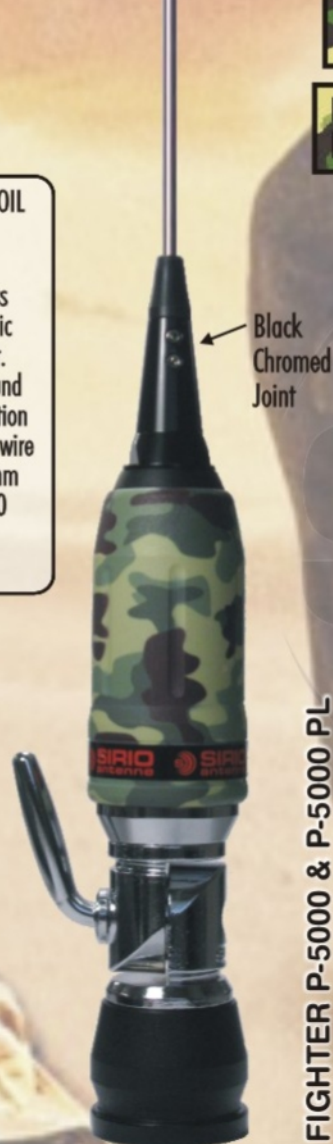
Black Chromed Joint

Low loss dielectric support. Air wound big section copper wire Ø 2.5mm AWG 10