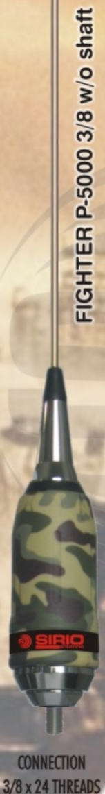
CONNECTION 3/8 x 24 THREADS