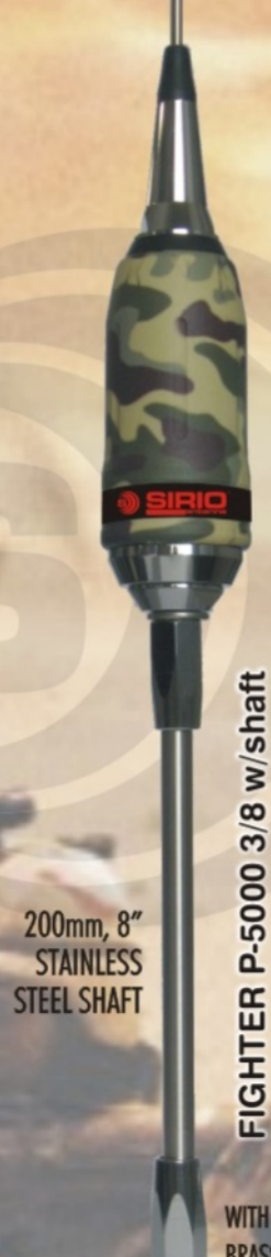
200mm, 8" STAINLESS STEEL SHAFT